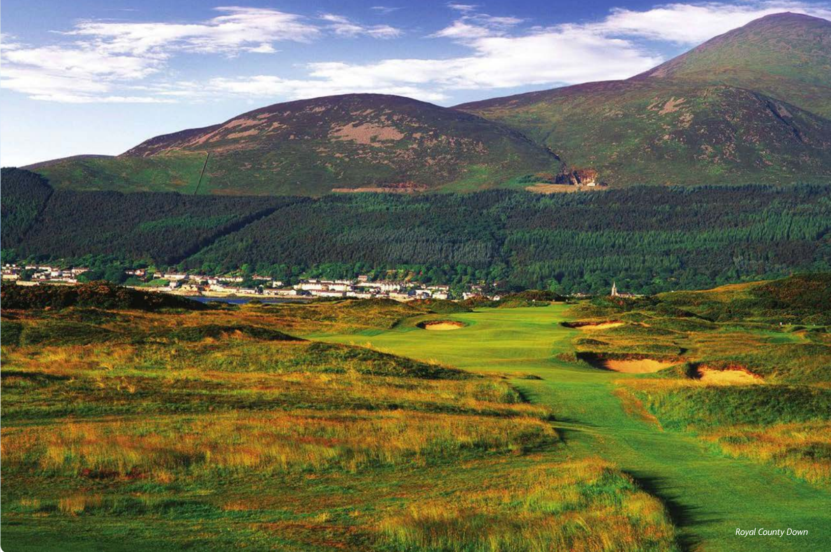
Royal County Down

The Irish Open made a triumphant return to Northern Ireland after almost 60 years this summer. How long has it been since you visited? Home to some of the world's greatest courses and certainly the most iconic links, Ulster seems tailor-made for a golf break. Here are some of the best it has to offer.